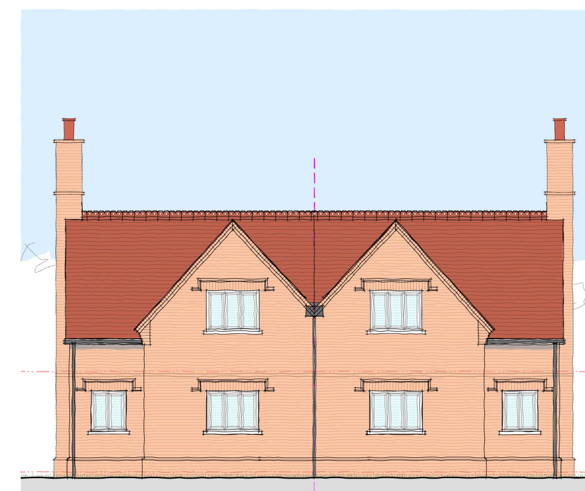
6 TYPICAL REAR ELEVATION Scale: 1:100

Proposed Ground Floor Area: 43m 2 Proposed First Floor Area: 39m 2 Total Floor Area: 82m 2