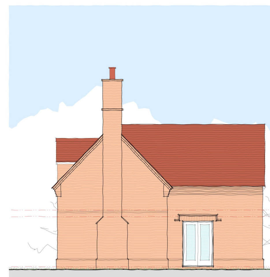
5 TYPICAL SIDE ELEVATION Scale: 1:100