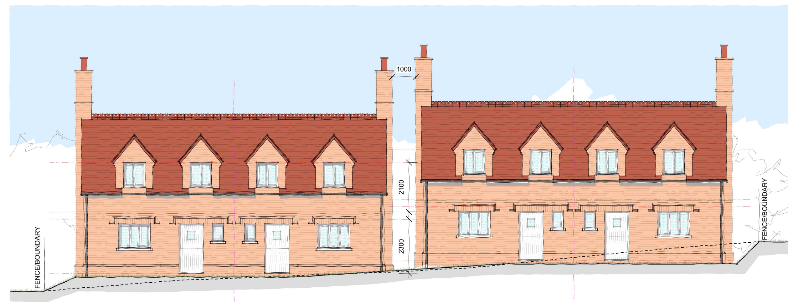
4 TYPICAL FRONT ELEVATION Scale: 1:100